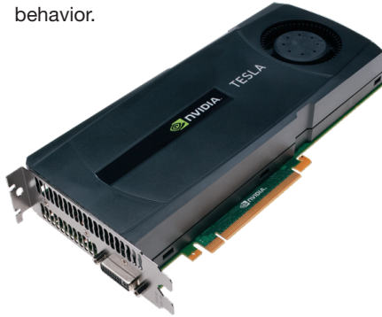
NVIDIA Tesla 20-series GPUs such as the C2050 and C2070 are the most computationally powerful and, therefore, most likely to produce faster solution times in ANSYS simulations.

should accelerate the solution, when possible, without requiring input from the user. For cases in which it does not apply, this new feature will simply have no effect on the program behavior.